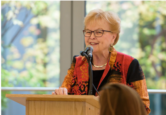
Gov. Barbara Roberts speaking at the anniversary luncheon