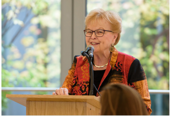
Gov. Barbara Roberts speaking at the anniversary luncheon

In November 2017, advocates and pioneers of the assisted dying movement gathered in Portland to celebrate two decades of implementation of the Oregon Death with Dignity Act.